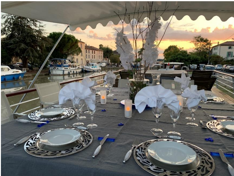
A nice al fresco dinner

The morning cruise will take you to Puichéric and its very artistic lock, then your guide will drive you up into the hills of the 'Montagne Noire' to visit an impressive abyss 200 meters underground! It's listed as one of the most beautiful caves in Europe and hosts the world's biggest geode! On your way back to the boat you will treat yourself to a wine tasting in the hilly Minervois region. Why not share another glass on the sundeck before your al fresco dinner?