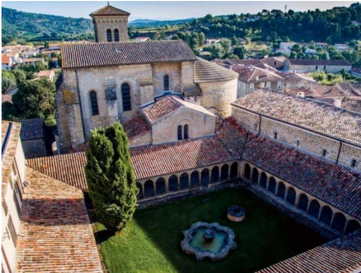
St. Hilaire Abbey

This morning your captain will sail to Marseillette. In the afternoon you will either be driven to the Maison de la Truffe for a truffle tasting or visit the St. Hilaire Benedictine abbey, which was founded more than a thousand years ago. The well and the fountain displayed in the very picturesque cloister were built in the 16 th century! Being very close to Carcassonne, the largest fortified city in Europe you could use this opportunity to run some errands while wandering in the shopping district or simply stroll in the medieval historic center if you haven't seen the 'Cité' yet. A nice dinner will then await you on board.