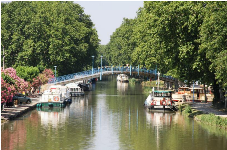
The port of Homps

A very special journey is about to begin! A member of the crew will welcome you at Narbonne's or Carcassonne's railway station around 4 PM and transfer you to your beautiful passenger boat 'Elegance' moored in the port of Homps along the famous Canal du Midi! After a first tour of the boat, a champagne reception will be served on deck as a nice premise to your week. You will then have plenty of time to discover your new environment and to settle in your bedroom before your gourmet dinner. And what about a little stroll along the canal to Jouarres lake at sunset to conclude your first day?